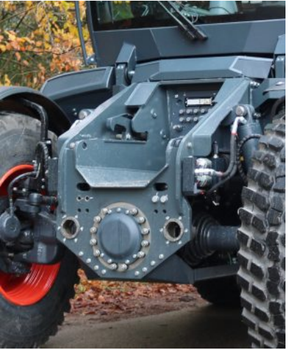
(http://s3-eu-west-1.amazonaws.com/ff-wp-assets-live/sites/1/2017/12/Syn-Trac-02.jpg) A unique couplings interface is used to attach a 3-point linkage or loader module, a trailer or tanker gooseneck drawbar, and a third axle.

Mounting the 420hp (310kW) Caterpillar engine and stepless transmission beneath the full-width cab ensures a clear view forwards and to the rear, while multi-mode 4-wheel steering make the relatively short vehicle highly manoeuvrable.