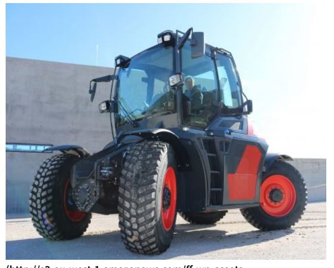
(http://s3-eu-west-1.amazonaws.com/ff-wp-assetslive/sites/1/2017/12/Syn-Trac-01b.jpg) Syn Trac is intended as a high-specification multi-purpose vehicle – the prototype has a 420hp engine and CVT transmission mounted centrally.

The 6×6 configuration is intended for applications that require load space behind the cab – to mount a sprayer or spreader body, for example, or a specialist module such as an auxiliary power unit to drive a snow blower.